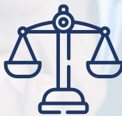
Litigations and Dispute Resolutions