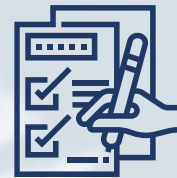
Labor and Employment