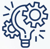
Intellectual Property & Technology

AIL was launched by an attorney, who has worked with US-based global law firms, to create an accessible platform to support clients entering the global market in an effective, efficient and flexible manner.