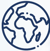
International Business Transactions