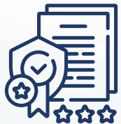
Regulations and Investigations